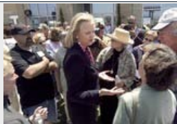
06/30/10 in Santa Paula: Meg Whitman speaks to some people after touring Santa Paula's new wastewater treatment plant. Whitman is running for governor of California and at the press conference she talk about creating jobs, education and cutting expenses.