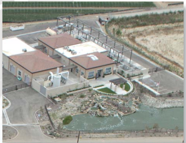
Aerial of Completed Facility