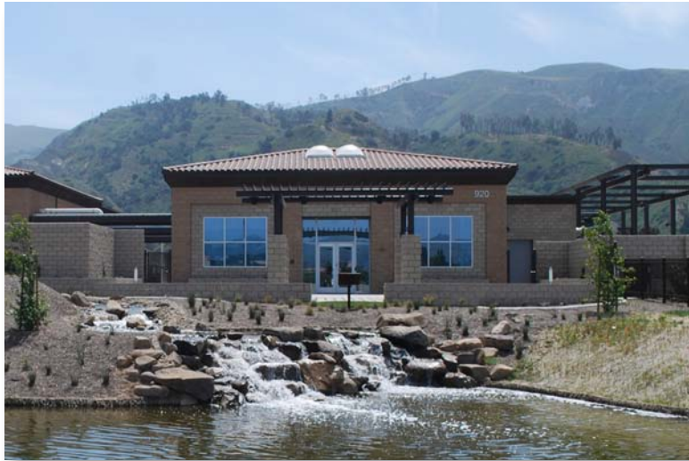
Santa Paula Water Recycling Facility