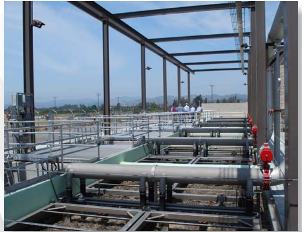
Membrane Separation Tanks