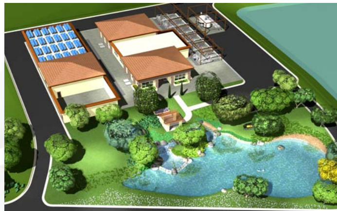
Rendering of Santa Paula Water Recycling Facility

Operations buildings containing process equipment, a laboratory, restrooms, workshop, break rooms and administrative offices are constructed above the tank structure, reducing land requirements. The Facility membrane cartridges are phased to meet the present requirements of the Regional Board and to coincide with flow capacity and development growth. The Facility has applicable noise and odor controls and is designed to blend with the surrounding community.