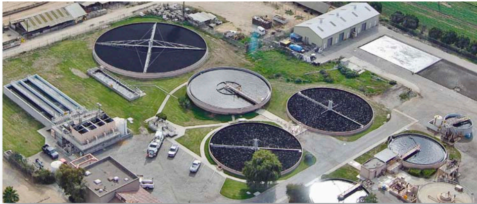
Original Santa Paula Wastewater Treatment Facility Originally built 1939

The City’s existing wastewater treatment facility was originally built in 1939, and had an average dry weather flow capacity of approximately 2.5 million gallons per day (MGD). The facility has reached the end of its useful service life and needs replacement. Additionally, the City was required to comply with the Waste Discharge Requirements of the Los Angeles Regional Water Quality Control Board and have a new Facility operating by December 15, 2010 or face more than $8 million dollars in fines.