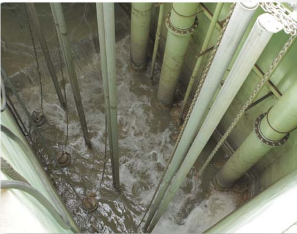
Influent Lift Station Tank