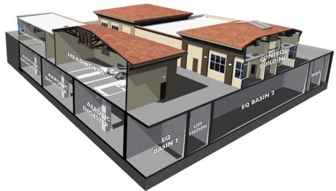
Rendering of Santa Paula WRF covered process tanks