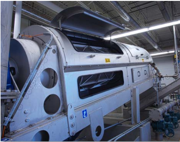
Huber Screw Press