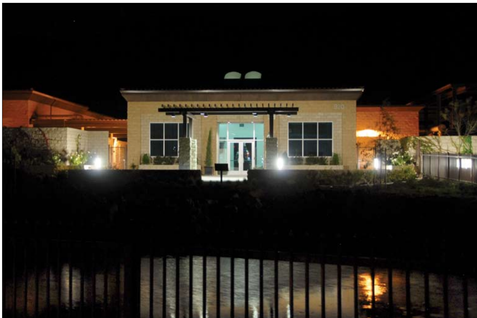
The Santa Paula water recycling plant is located behind the old plant off Corporation Road. Above is a night shot of the plant. A large pond of water in front is used for storm water containment. The majority of the systems used to treat wastewater is located below the main building pictured above.