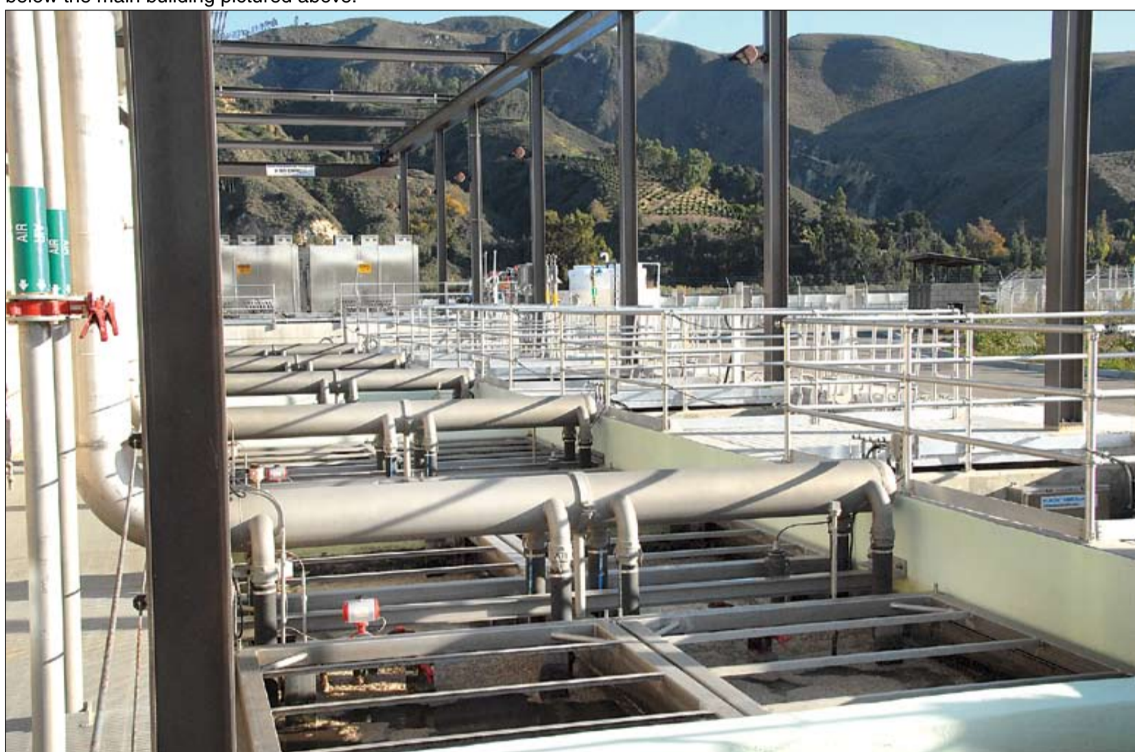
The Santa Paula water recycling plant is complete and meets the State Water Quality standards. The plant was built on time. The deadline for the completion of the plant was December 15. The plant with miles of piping, filters, and treatment has been online for several months and has been working as designed and planned.